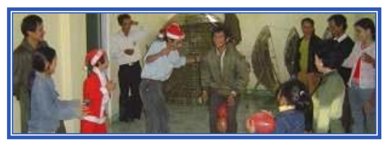
The Solar Serve family